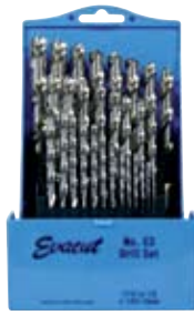
E3 - 170968