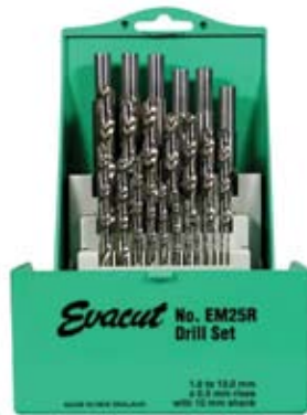
EM25R - 174977