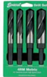
4RM - 176794