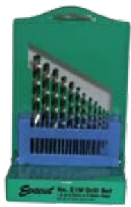
E1M - 174955