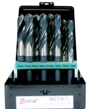
8RM - 176801