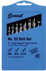
E2 - 170941