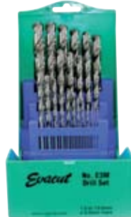
E3M - 174971