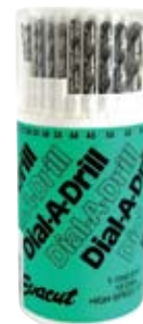
DD19M - 175330