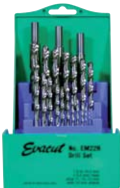
EM22R - 174974