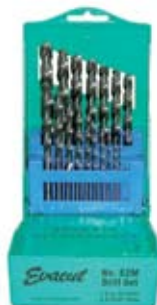
E2M - 170963