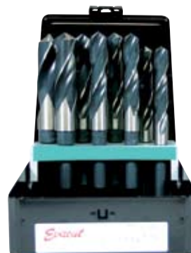
8R - 171801