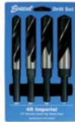
4R - 171794