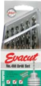
No.4M - 175129