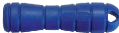
4910961 - No.7 File Handle